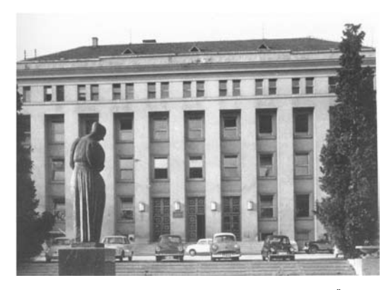
Figure 2. Zagreb school of "public" health (today's Andrija Štampar School of Public Health), founded in 1926 and opened on October 3, 1927.

texts, but also in the language of other representatives of the sociomedical movement. Francisco Murillo (1865-1944) used it as an argument for the introduction of social insurance in Spain and René Sand (1877-1953) after he moved from social biology toward social epidemiology in the early 1930s (13). While Štampar considers poverty as a congenital social disease, the source and setting of social diseases; he calls alcoholism, tuberculosis, and sexually transmitted diseases the most devastating cancer of today's society (12).