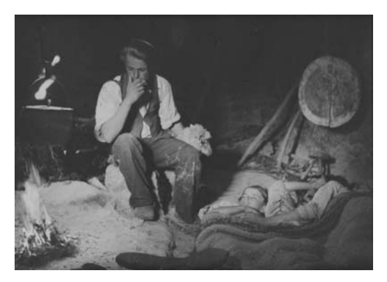
Figure 4. Štampar called tuberculosis the "disease of poor-quality housing." Such damp, stale spaces full of evaporations of infected saliva were common in the city of Zagreb in the first decades of the 20th century.

The main reason for the spread of sexually transmitted diseases, in Štampar's opinion, was prostitution. His view of the problem was also sociological, with a special emphasis paid